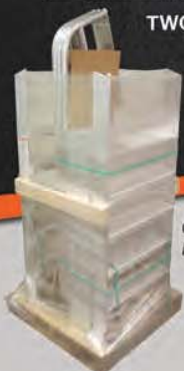
Crossover Bridge Packaged for Shipment

TWO STEP TREAD CHOICES - Serrated treads offer excellent slip resistance and an open-grid design that allows dirt and liquids to fall through. Diamond-plate treads also provide slip resistance, and its solid surface does not allow anything to fall through.