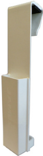
24-18L Fiberglass Chainsaw Scabbard with Removable Liner Fits standard and hydraulic pistol grip chainsaws. Adjustable clamp bracket. 32.5"H x 7.5W x 7"D

Adjustable clamp bracket allows tool holder to fit any size bucket, with or without liner, and mounts inside or outside bucket.