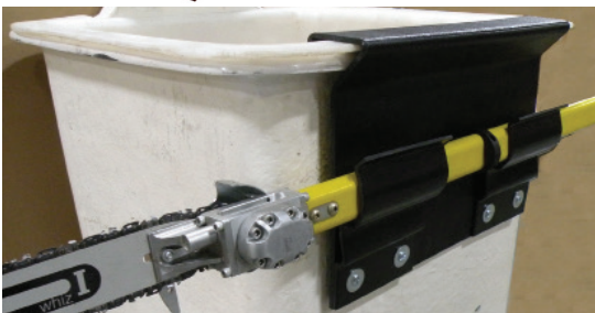
24-23 Long Reach Chainsaw Holder For Telescoping Boom Trucks or Spider Lifts.

Holds round- and oval-handled long reach hydraulic chainsaws and gas powered pole pruners (standard and telescoping). 14"H x 18"W x 4"D