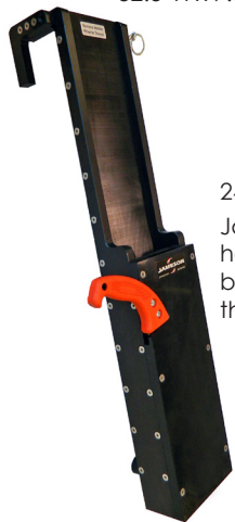
24-19 Chainsaw Scabbard with Handsaw Holder Jameson's latest chainsaw scabbard includes a handsaw holder for easy access during line clearance work. To prevent blade wear and protect against extreme weather conditions, the scabbard is constructed with durable HDPE.