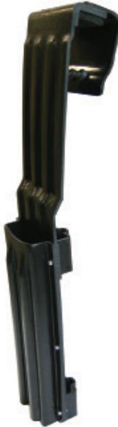
24-14A Chainsaw Scabbard Fits standard and hydraulic pistol grip chainsaws. Adjustable clamp bracket.