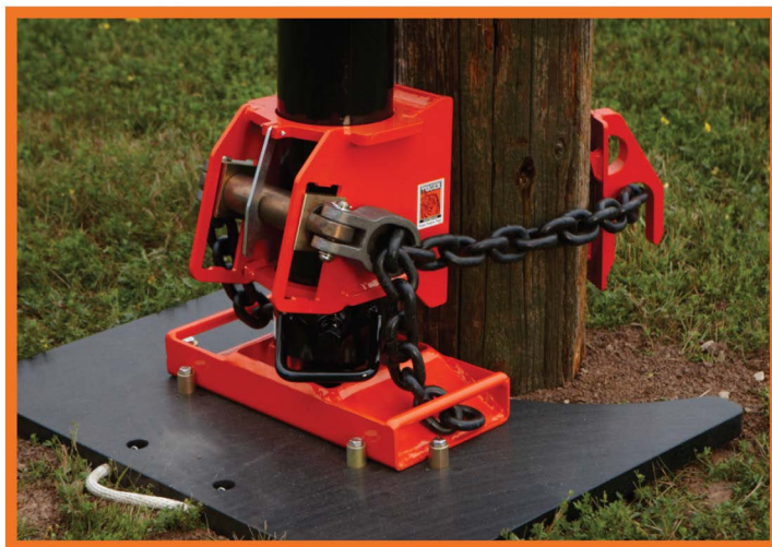
Swivel assembly pre-tensions the chain providing maximum lift per stroke.