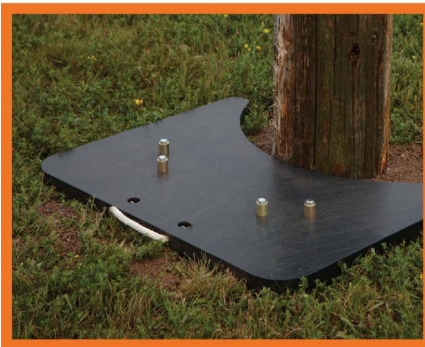
Engineered with the strength to take the full force of the pole pulling, and the flexibility not to crack