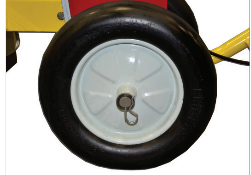
Flat-Free rubber tires.