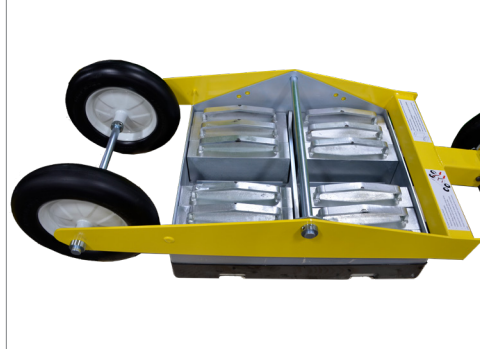
Cast weights or cans available.