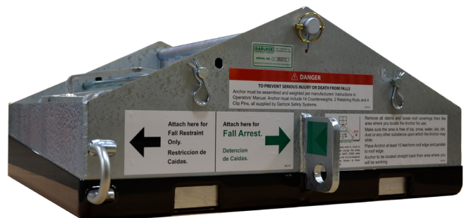
Tie off points for Fall Arrest and Fall

Built to Last: With galvanized and powder coated corrosion resistant components and few moving parts, LifePoint will perform for years.