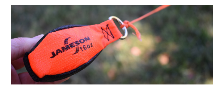
Throw Bags and Line