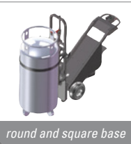
round and square base