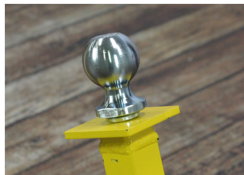
Shown with pintle hitch adapter installed.