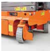
0° Turn Radius

Ballymore's drivable electric scissor lifts are the industry leaders for construction maintenance. Designed to increase productivity on the worksite, these lifts offer the ability to be used in both indoor and outdoor applications. Characterized by user friendly controls, Ballymore scissor lifts are easily adaptable and provide excellent handling capacity.