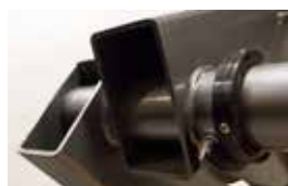
Industrial Grade Weld