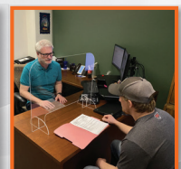
ArmorBoss™ Table Shields