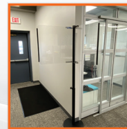
ArmorBoss™ Floor Stand Shield

Ask about our other ArmorBoss™ products: