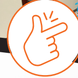
Easy To Assemble