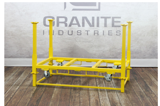
Shown with 33" chair storage rack (67136)