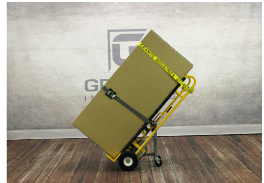
Shown with gray tie strap and yellow E-Strap.