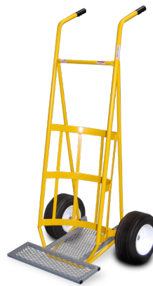
Shown with Rock/ Utility Tray (67130)