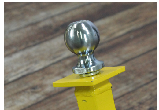
Shown with pintle hitch adapter installed.