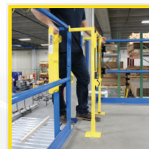
Stand-Off Mounting System