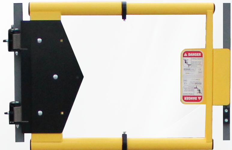
Product Number: ASG-1836-PCY