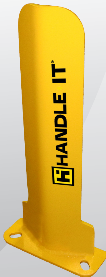
Shallow Profile Post Protector

Personal and professional customer service is offered on all Handle-It® Post Protectors. Our Post Protection carries a one-year limited warranty on all materials and workmanship.