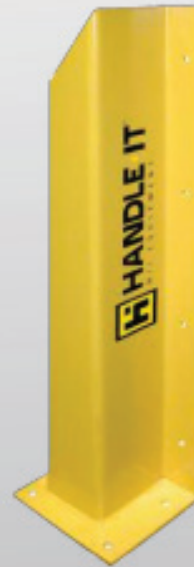
Typical 48" Track Guard

Personal and professional customer service is offered on all Handle-It® Track Guards. Our Track Guards carry a one-year limited warranty on all materials and workmanship.