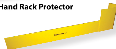
Right Hand Rack Protector