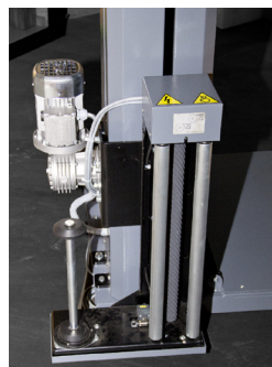
Electromagnetic film tension with easy film threading

Adjustable parameters by the control panel: cycle selection, bottom turns, top turns, rotation speed, carriage speed going up, carriage speed going down, film tension.