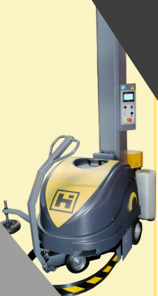
Advanced Touchscreen Controls