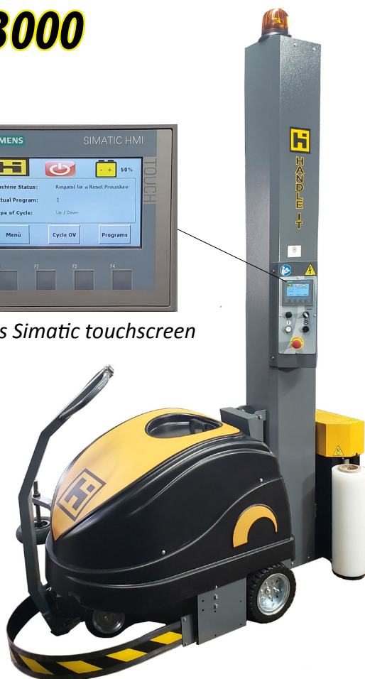
Part Number: SWM-MR-3000