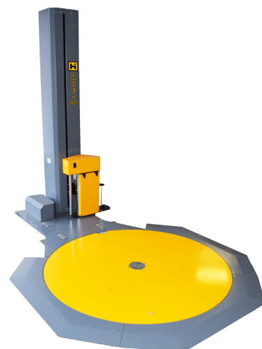
Patented Ultra Low Frame

Belt driven pre-stretch carriage for added reliability Rack and pinion carriage system vs. traditional chain driven to increase durability