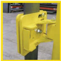
FLAT BAR ADAPTER BRACKET (FB-2205)