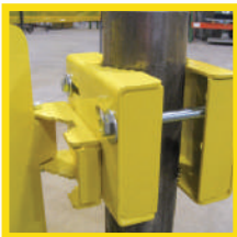
LARGE PIPE ADAPTER BRACKET (LP-2204)

Compatible with the EdgeHalt Single or Full Height Ladder Safety Gate, this adapter bracket is for customers with unique mounting needs.