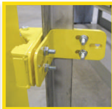
ANGLE IRON ADAPTER BRACKET (AC-2206)