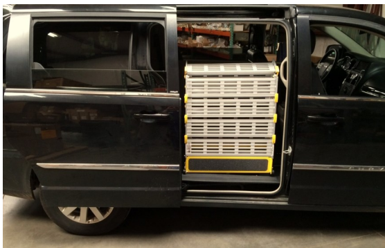
Side install on vans like Dodge Caravan