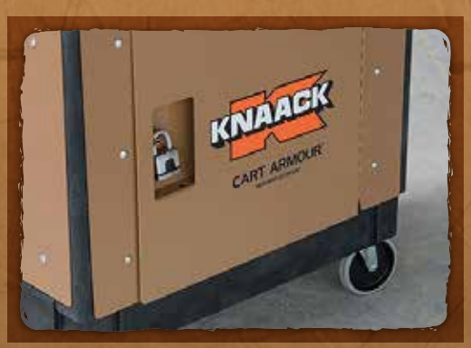
Heavy Duty Construction