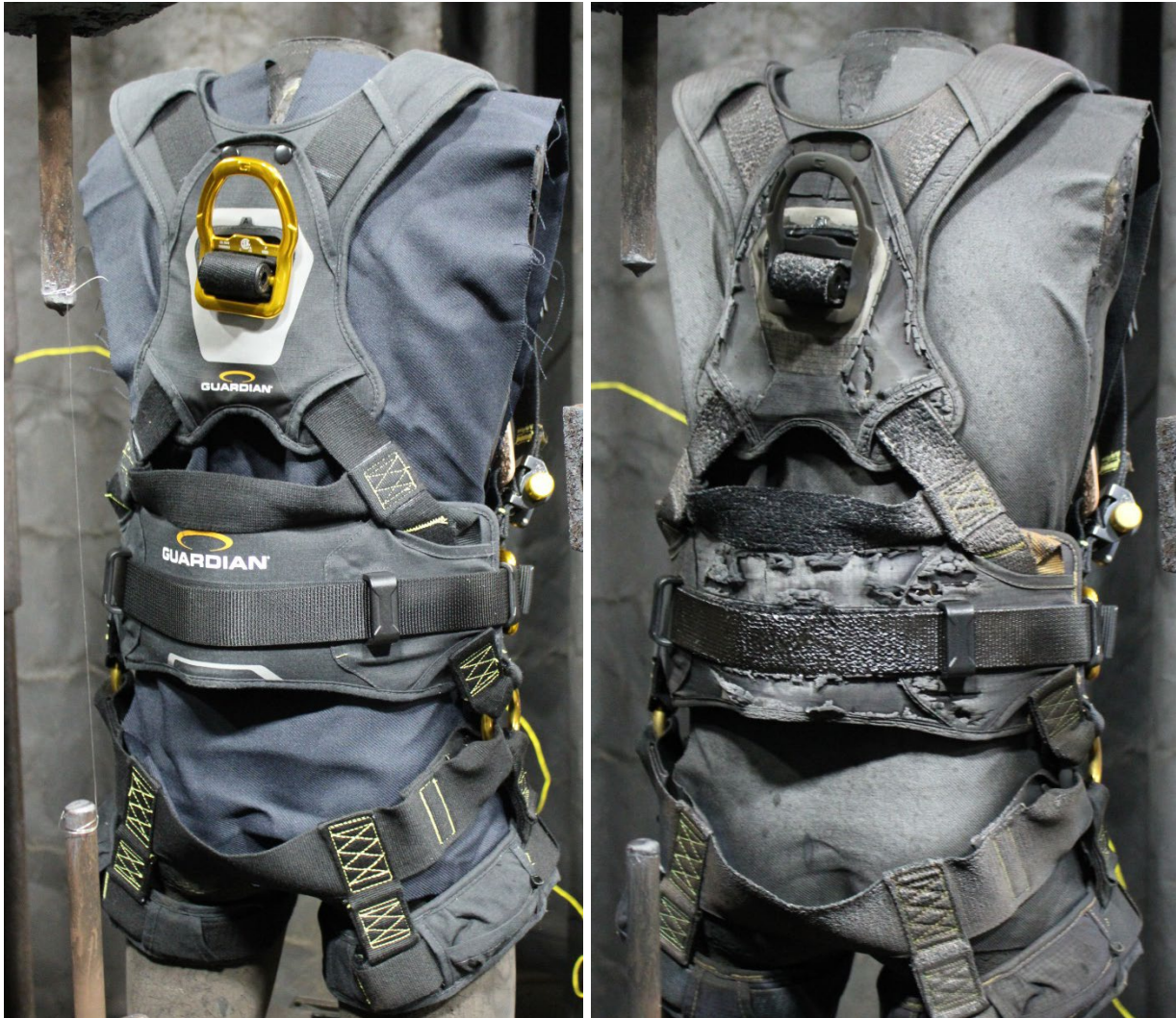
Figure 6.5: Sample before and after arc exposure, test 24-00221B