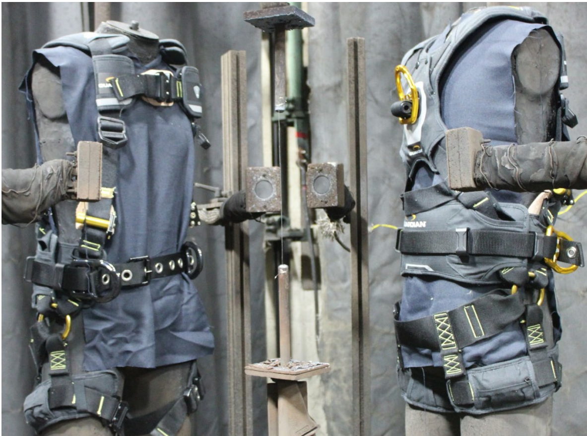
Figure 6.1: Sample set up before arc exposure.

The following photographs are representative of the test results observed.