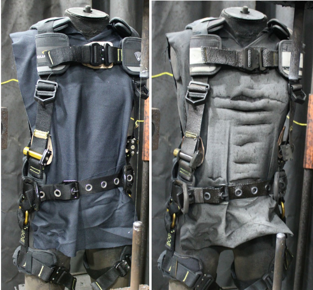
Figure 6.2: Sample before and after arc exposure, test 24-00219A.