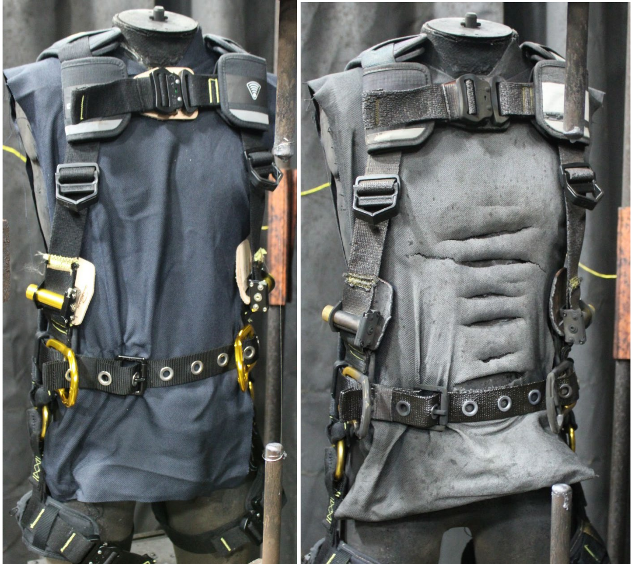
Figure 6.4 Sample before and after arc exposure, 24-00221A