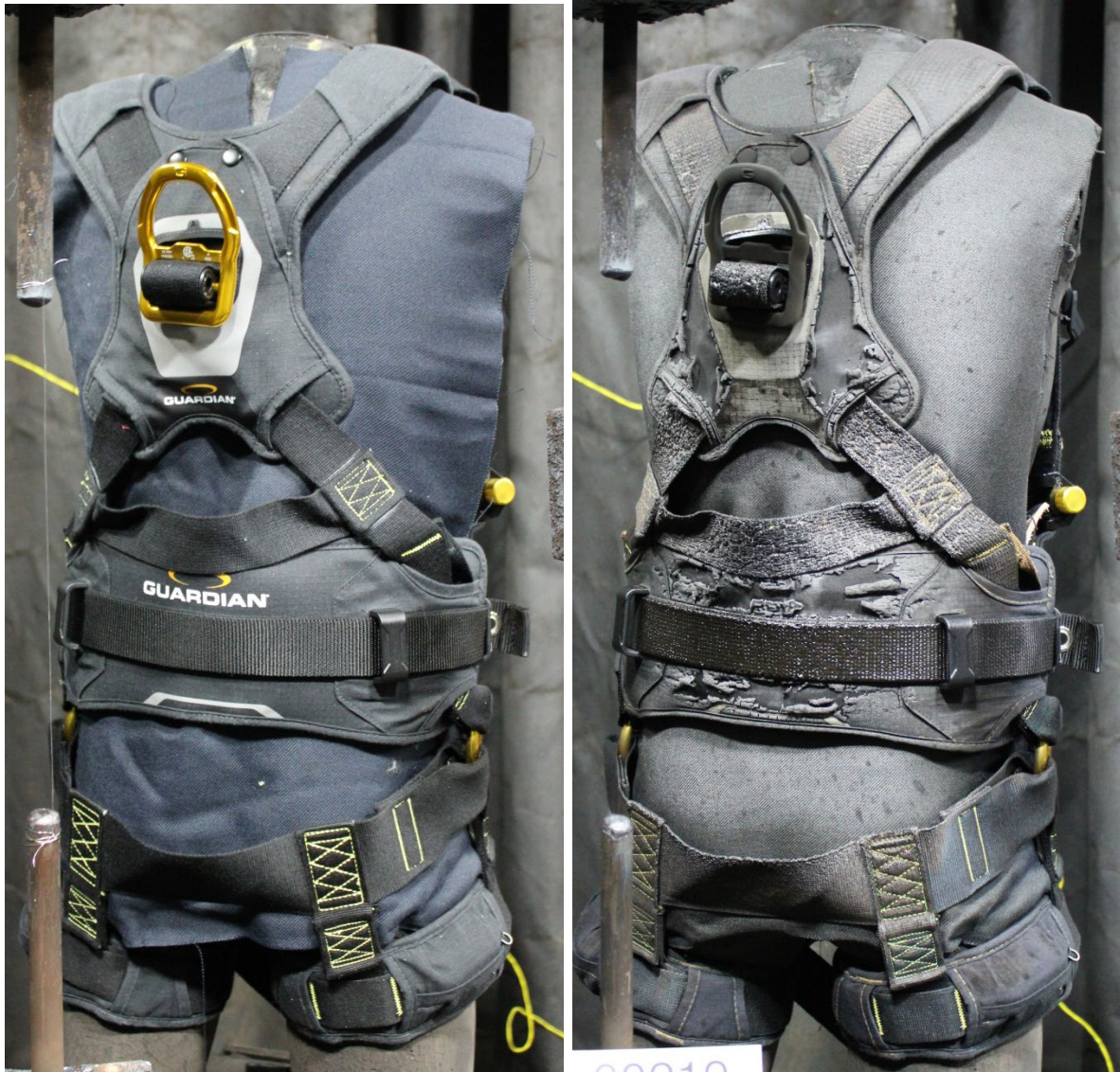
Figure 6.3: Sample before and after arc exposure, test 24-00219B.