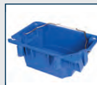
UTILITY BUCKET Model AC52-UB