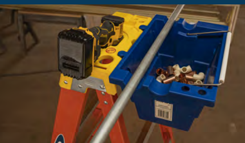
LOCK-IN™ accessory system secures tools and expands ladder top