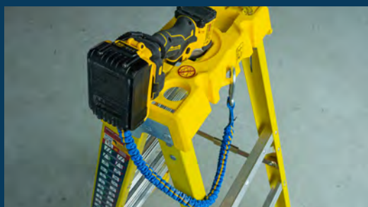
Three position anchor points prevent tools from accidentally falling while working at height