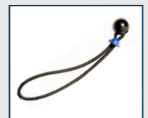
TOOL LASSO Model AC58-TL