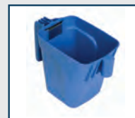
PAINT CUP Model AC27-P