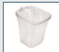
PAINT CUP LINER Model AC27-L

Ask your Sales Representative for details and availability.