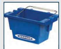
JOB BUCKET Model AC50-JB-3