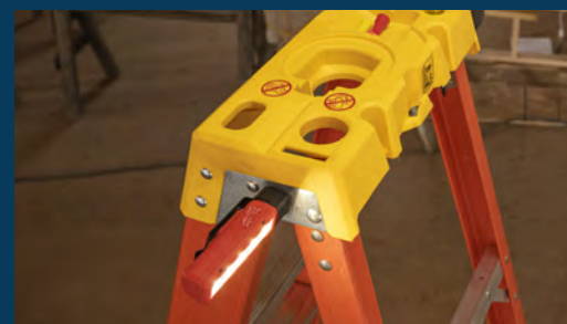
Metal plate holds magnetic accessories like flashlights & laser levels