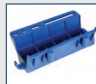
JOB CADDY Model AC54-JC